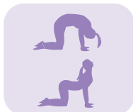
Cat (arched back and straight back)